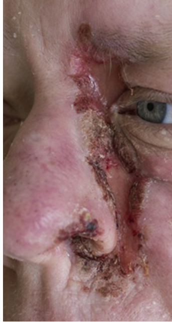
Fig. 1. 48-year-old woman with trigeminal trophic syndrome.

twice over the next year. Both times, her doctors sent her home with a PICC line for more IV vancomycin. Convinced that the woman had refractory cellulitis, her outpatient doctors gave her additional courses of oral antibiotics. Despite these treatments, the lesion on her face never improved.