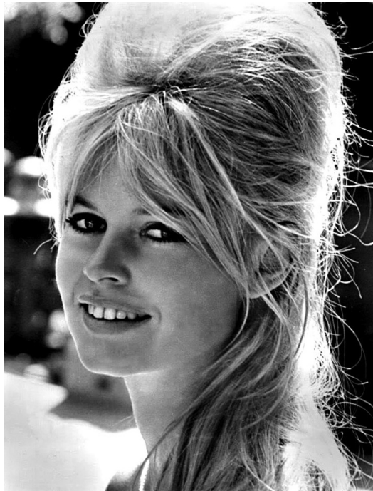
Fig. 4. Brigitte Bardot.

Croskerry has described how patterns of bias can corrupt diagnostic reasoning. His survey 29 of 32 common errors in diagnostic reasoning includes habits of thought that most doctors will find familiar, such as the sunk costs phenomenon—"the more clinicians invest in a particular diagnosis, the less likely they may be to release it and consider alternatives"—and anchoring—"the tendency to perceptually lock onto salient features in the patient's initial presentation too early in the diagnostic process, failing to adjust this initial impression in light of later information." An abbreviated version of Croskerry's list is presented in Table 1.